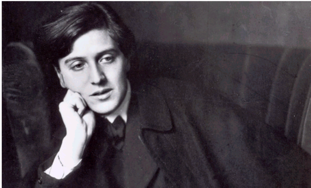
Tribute: to Alban Berg, the austrian composer

Published: 14 November 2010 ★ Recommend (0)